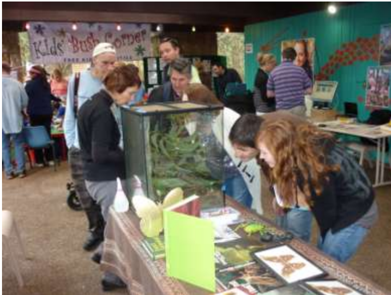
ESNSW stand at Ku-ring-gai Wildflower festival