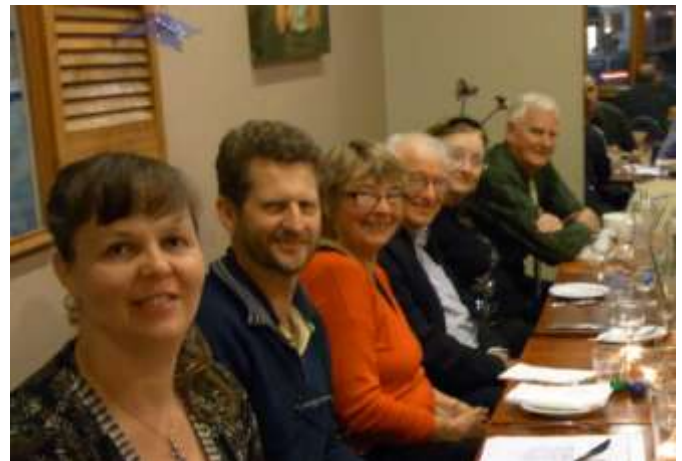
One of the few photos Gith managed to get into..