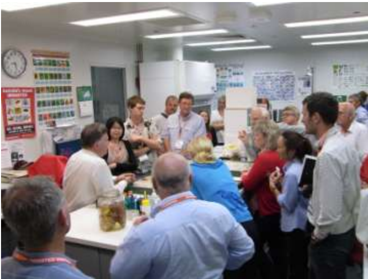
The lab tour inspired lots of questions, especially from the visitors.