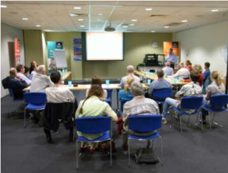
Attendance at the meeting was boosted by invitations to various chemical and food industry groups